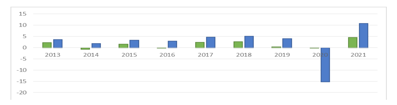
Green – inflation(%); blue – growth rate

The euroization system is like a kind of self-balancing mechanism in an open and liberal economy. This means that if the inflation rate is considered over a longer period of time, it actually corresponds to the average inflation rate in the euro area.